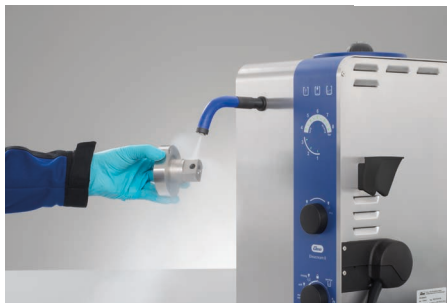
Cleaning with fixed nozzle and foot pedal Ideal for working with both hands or for larger workpieces.