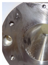
Removal of grease and silicone