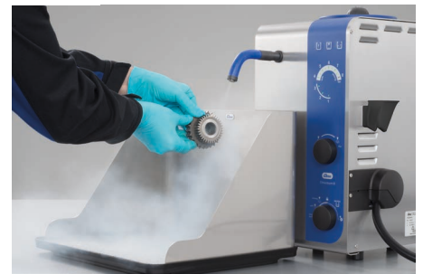
Cleaning in the evaporating dish Moisture and dirt are absorbed and can be easily disposed.