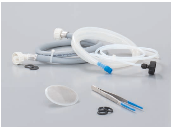
Tweezers · Sieve · Maintenance hose · Rinsing set · Tank cap

Further accessories and optional unit functions: