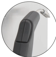
Compressed air (optional function)