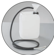
Canister with filling level meter

*3 years warranty for proper use in accordance with the operating manual. Wear parts are not covered by the warranty.