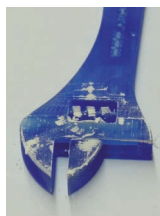
Removal of wax