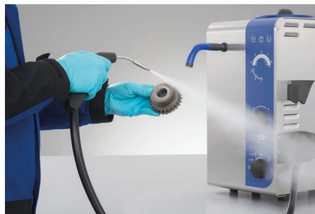
Cleaning with flexible handpiece Parts can be held securely (also with tweezers) and sprayed all-round quickly and effectively.