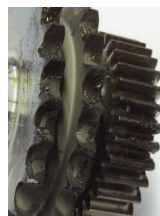
Removal of oil and swarf